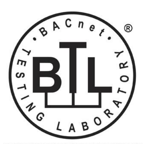
BACnet is a registered trademark of ASHRAE. ASHRAE does not endorse, approve or test products for compliance with ASHRAE standards. Compliance of listed products to requirements of ASHRAE Standard 135 is the responsibility of the BACnet International. BTL is a registered trademark of the BACnet International.